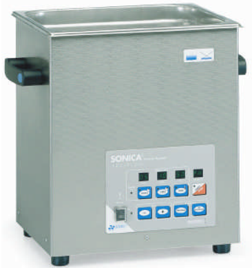
3300EP with Sweep System (pictured)

SONICA® ultrasonic cleaners are made using advanced electronic components and are available in various models.