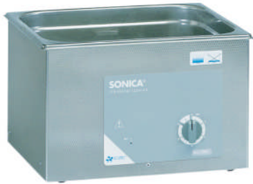
3200M with Manual Timer (pictured)